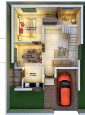
GROUND FLOOR AREA