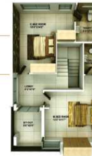
FIRST FLOOR AREA