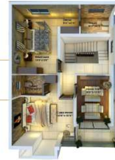
FIRST FLOOR AREA