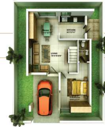
GROUND FLOOR AREA