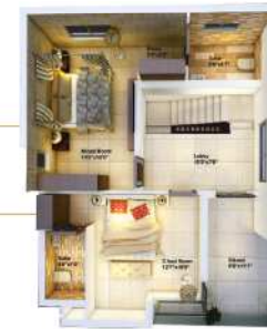
FIRST FLOOR AREA