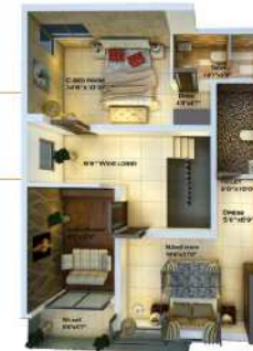
FIRST FLOOR AREA