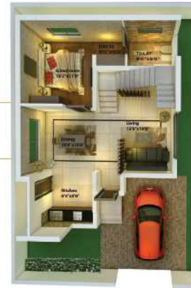
GROUND FLOOR AREA