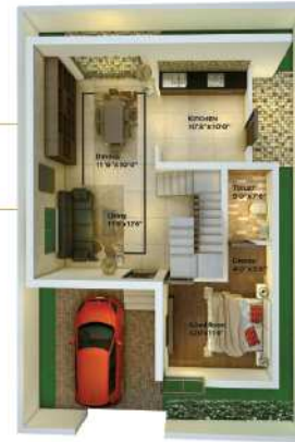
GROUND FLOOR AREA