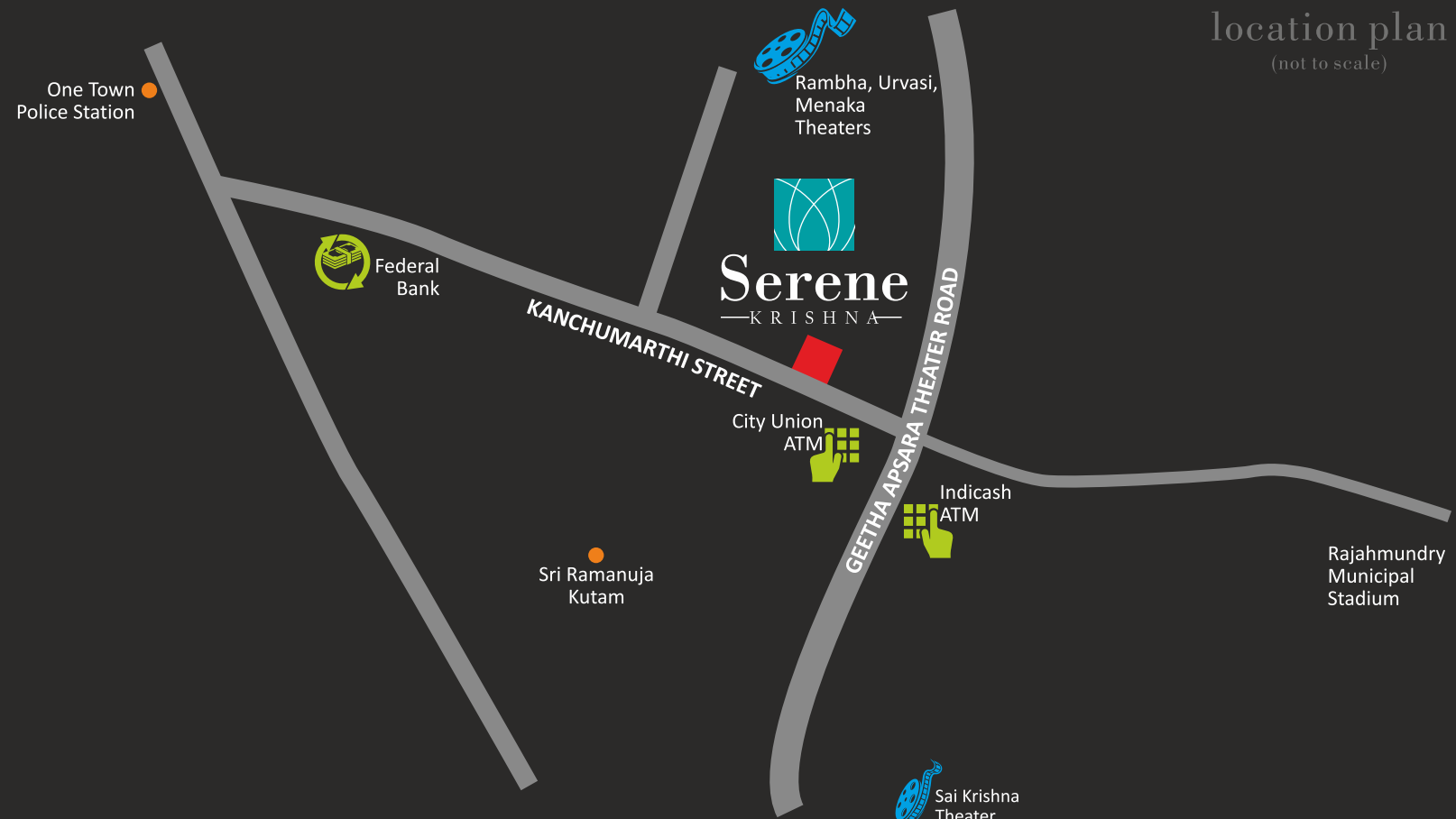
location plan (not to scale)

Live life in the thick of the action. Exciting, atmospheric street -life is right on your doorstep. Step outside and explore more than you ever imagine